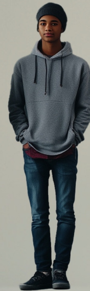
The You Tuber